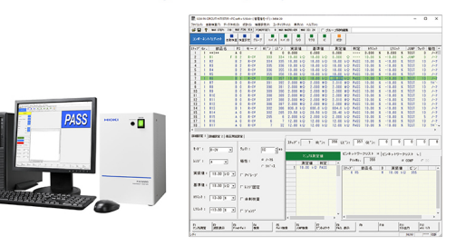
Creating test data quickly