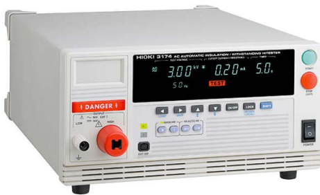
3174 AC AUTOMATIC INSULATION/WITHSTANDING HiTESTER