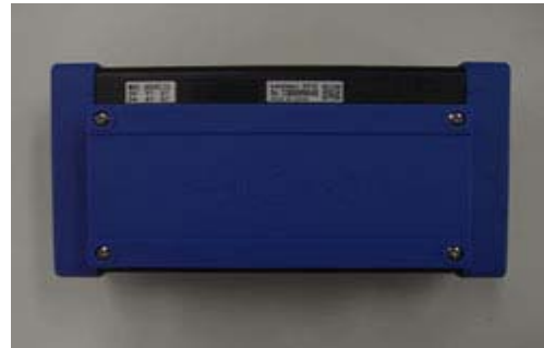
Fig. 2 With protector attached

If the screw is fully tightened, the screw can come into contact with the voltage input terminal.