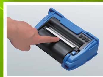
One-touch easy load printer option is indispensable for factory maintenance