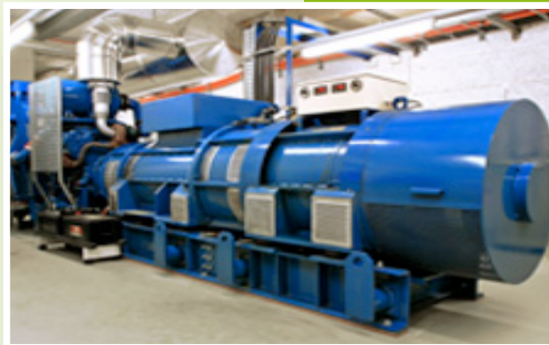
Figure 1: Dynamic UPS

According to the Project Engineer, when there is a failure at the main power grid, the switching of the Dynamic UPS from “Normal Mode” to “Emer-