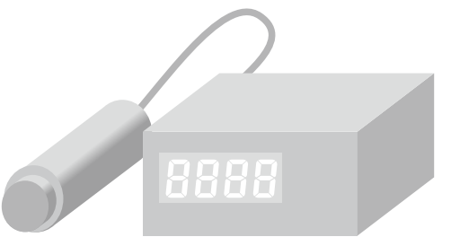
Commercially available gas concentration analyzer