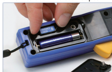
Step 1: Install Z3210 to the instrument. (Location varies according to the model.)