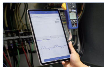
Step 2: Start the installed app.