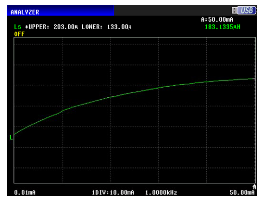
Measurement example of current characteristics (Analyzer mode)