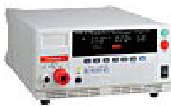
3174 AC AUTOMATIC INSULATION/WITHSTANDING HiTESTER