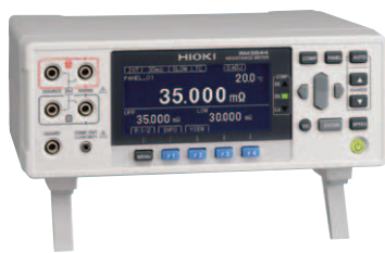
RESISTANCE METER RM3544

Use the Hioki RM3544 or RM3545 Resistance Meters to directly read volume resistivity