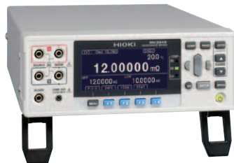
RESISTANCE METER RM3545