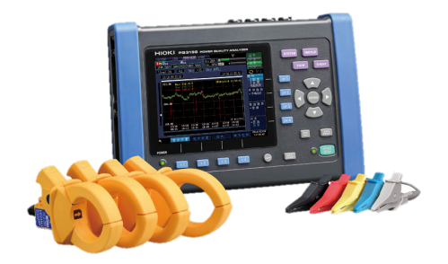
Power Quality Analyzer PQ3198