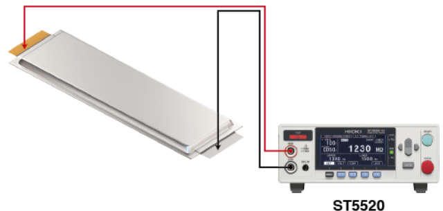
Measurement of insulation resistance between electrodes