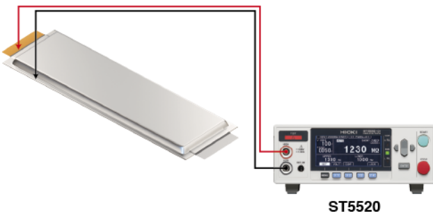
Measurement of insulation resistance between the electrode and the enclosure

(Applying a voltage after the battery has been filled with electrolyte can cause damage)