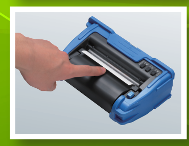
One-touch easy load printer option is indispensable for factory maintenance

■ All information correct as of April 2012.