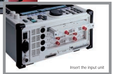
Insert the input unit