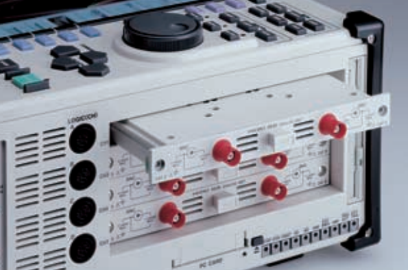
The photograph shows the 8841 with the 8936 analog unit attached.