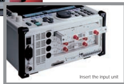
Insert the input unit